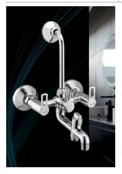
Wall Mixer 3-in-1