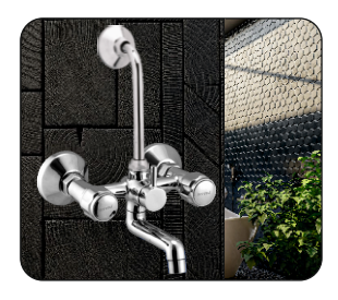
MINI DELUXE 08