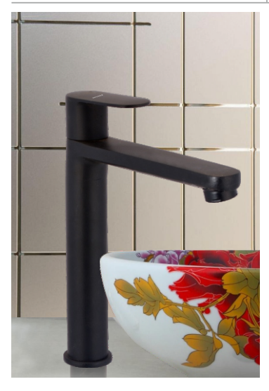
Long Pillar Cock 9" Glamour