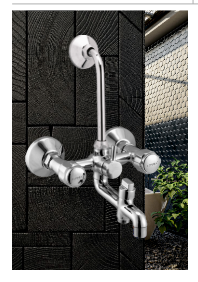
Wall Mixer 3-in-1