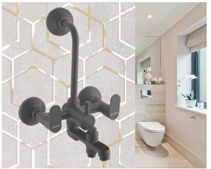
Wall Mixer 3-in-1