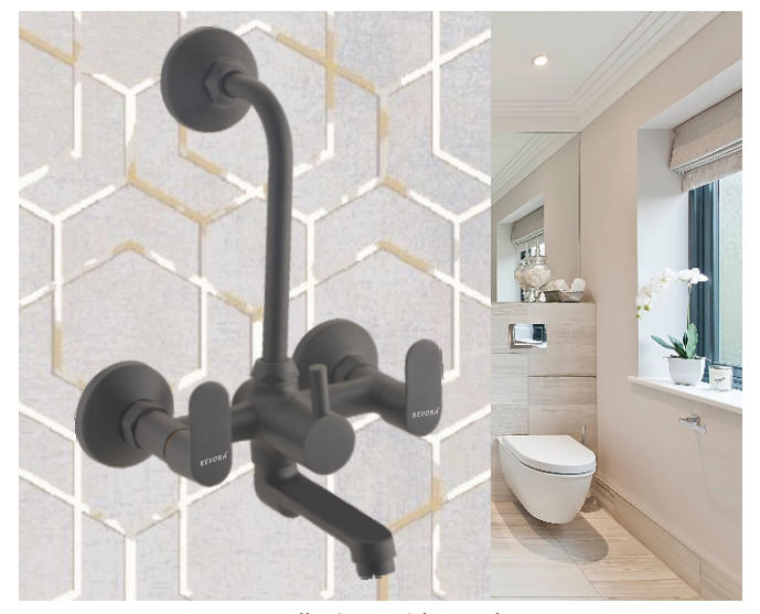
Wall Mixer With Bend